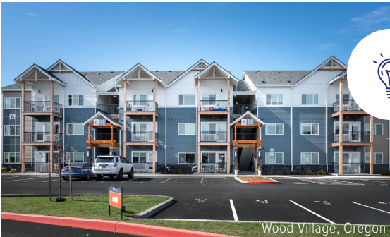
Wood Village, Oregon