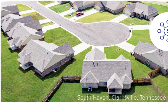
South Haven, Clarksville, Tennessee